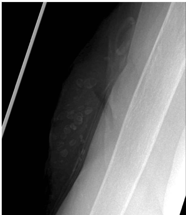
Figure 2: Enlarged detail of Figure 1.

After thorough questioning the patient remembered, that she had received a 24-hour monitoring of her blood pressure shortly before the onset of her chief complaint, during which the blood pressure cuff—which was changed from one arm to the other in the course of the examination—had caused her severe pain. Based on the morphology of the calcifications, the localization of both “traumatized” upper arms,