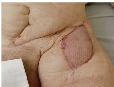
Figure 4: Healed groin by well-incorporated muscle flap without signs of infection.