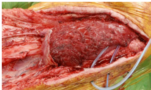
Figure 3: Covering the prosthesis circularly with sartorius and rectus femoris muscles flaps that was folded up.