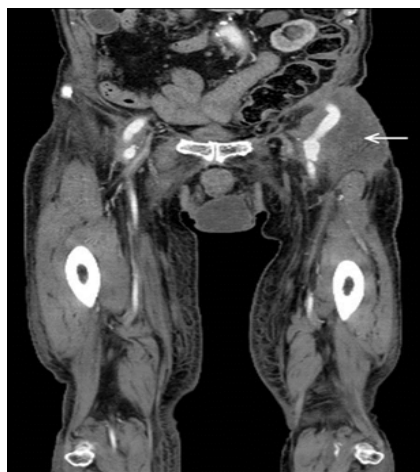
Figure 5: Follow-up CT demonstrated no fluid surrounding the graft (arrow: muscle flap).

In the absence of retroperitoneal spreading of the infection, the rectus femoris muscle flap based on proximal insertion mobilization is a less invasive alternative to cover infected vascular grafts in the groin [6].