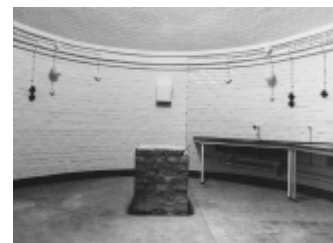
Figure 5: A.A. Michelson performed his experiment in this circular cellar (photo dated 1969) that is in the basement of the dome seen far right in Figure 3 (Haubold and John 1982).

In preparation of the Einstein Centenary, celebrated in Berlin in 1979 and the Michelson Anniversary, celebrated in Potsdam in 1981, young enthusiastic and dedicated staff scientists of the Observatory refurbished the cellular basement where Michelson placed his interferometer equipment (Figure 5) and set up an exhibition of scientific documents and photographs that reflected the situation of physics at the turn of the 19th century after Max Planck's discovery of black body radiation formula and before Alberts Einstein's Annus Mirabilis.