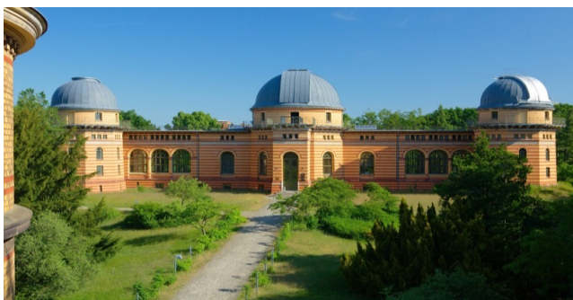
Figure 3: Astrophysical Observatory Potsdam, about 1979.

The Colloquium in Potsdam was officially hosted by the Astrophysikalisches Observatorium Potsdam (Astrophysical Observatory Potsdam, Figure 3) that comprises the Michelson cellar where Albert Abraham Michelson performed the experiment in 1881 for the first time that carries his name today (Figure 5) [9].