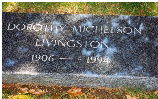
Figure 8: Grave stone of Dorothy Michelson Livingston at Southhampton Cemetery, New York.