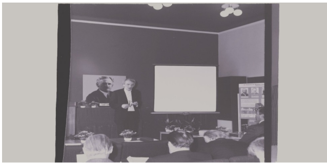
Figure 2: Prof. Dr. h.c. mult. Hans-Juergen Treder (born 4 September 1928 in Berlin; died 18 November 2006), Patron of the Michelson Colloquium at the opening ceremony of the Colloquium.

The Colloquium in Potsdam was officially hosted by the Astrophysikalisches Observatorium Potsdam (Astrophysical Observatory Potsdam, Figure 3) that comprises the Michelson cellar where Albert Abraham Michelson performed the experiment in 1881 for the first time that carries his name today (Figure 5) [9].