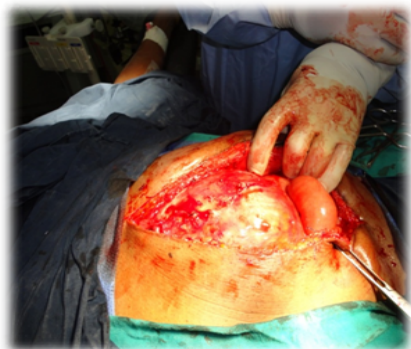
Figure 3: Longitudinal midline laparotomy, displaying the pseudoaneurysm.

hepatic and splenic artery branches were identified and suture ligated; (Figures 4-8). The sac was carefully trimmed down and obliterated using absorbable suture, vicryl 2/0. The resected specimen was sent for histology. Abdomen was closed with indwelling catheter, 28 Fr. He had 3 units of blood intra-operatively and a unit of blood postoperatively. He made uneventful recovery and was discharged home on the 8 th postoperative day and had been followed up severally at the surgical outpatient with no complication. Histology of the specimen (pieces of the sac): inflammatory due to chronic pancreatitis.