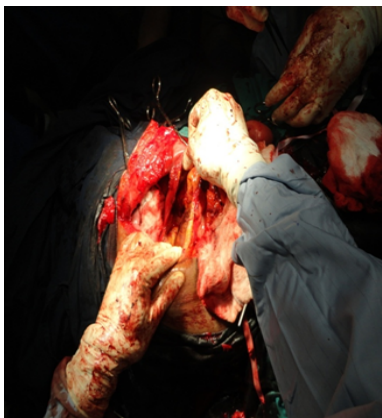
Figure 8: The aneurysmal sac being displayed.

branch of hepatic and a branch of splenic arteries which coalesced to form a common cavity.