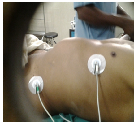
Figure 1: Abdomen distension around epigastric region.

A proximal control of the abdominal aorta was obtained with aortic cross clamp above the mass after infusion of 5 international units of unfractionated heparin. Distal control was obtained by identifying the common iliac arteries and snaring them with tapes. The aneurysmal sac was then opened and the above findings noted. The orifices of the