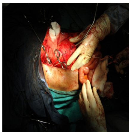
Figure 5: Proximal aortic crossclamp above the pseudoaneurysm.