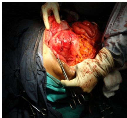
Figure 4: Midline longitudinal and left transverse laparotomy displaying the pseudoaneurysm.

The most common location is at the level of splenic artery (58%), hepatic artery (20%), superior mesenteric artery (8%), including gastroduodenal and pancreaticoduodenal arteries and inferior mesenteric artery (1%) as well as the celiac artery(4%) [7-9]. It may be multiple [10]. Our index patient had pseudoaneurysm involving a