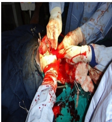
Figure 7: Aneurysmal sac opened and blood and thrombi being removed.