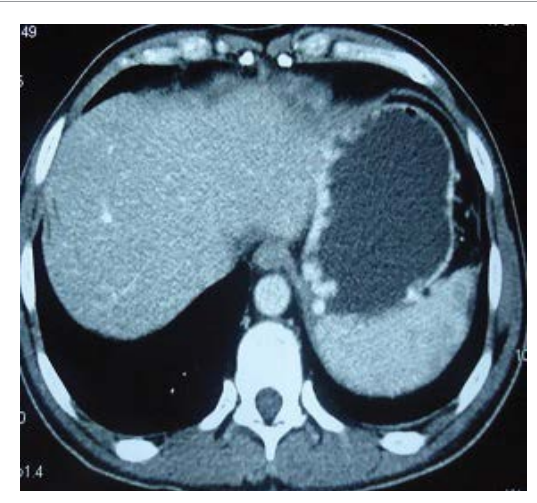
Figure 1: III-defined pancreatic mass.