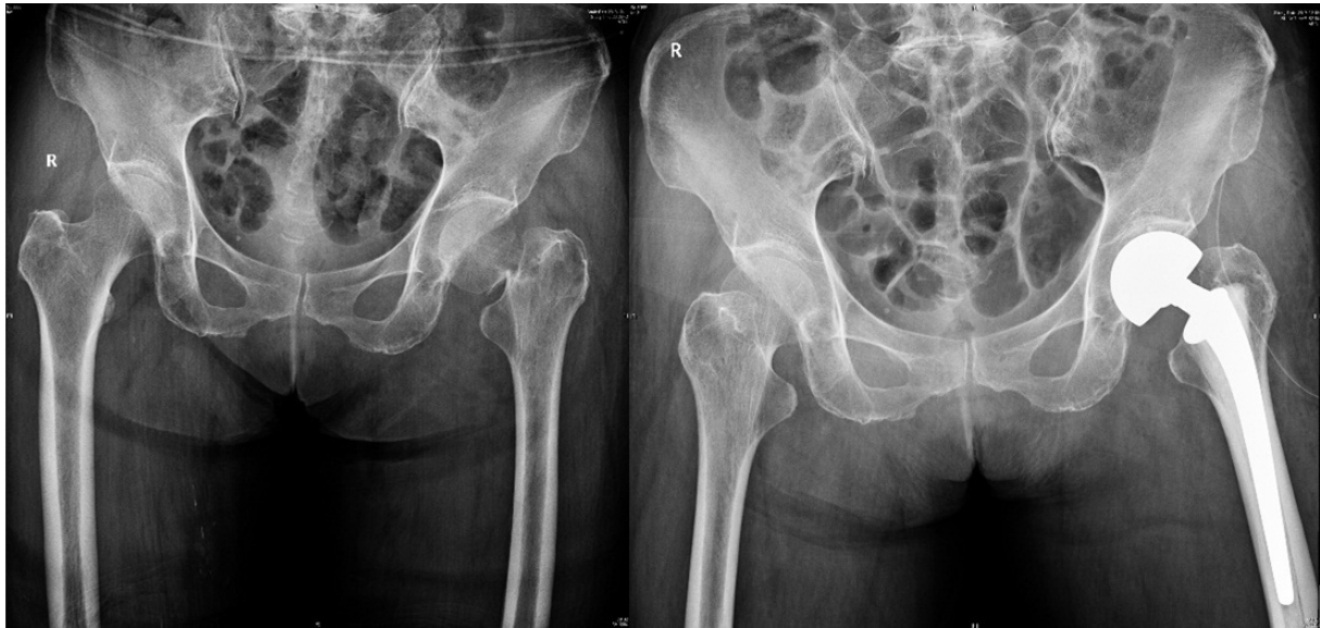
Figure 1: Preoperative X-ray showed left displaced femoral fracture, postoperative X-ray showed the bone cement prostheses.