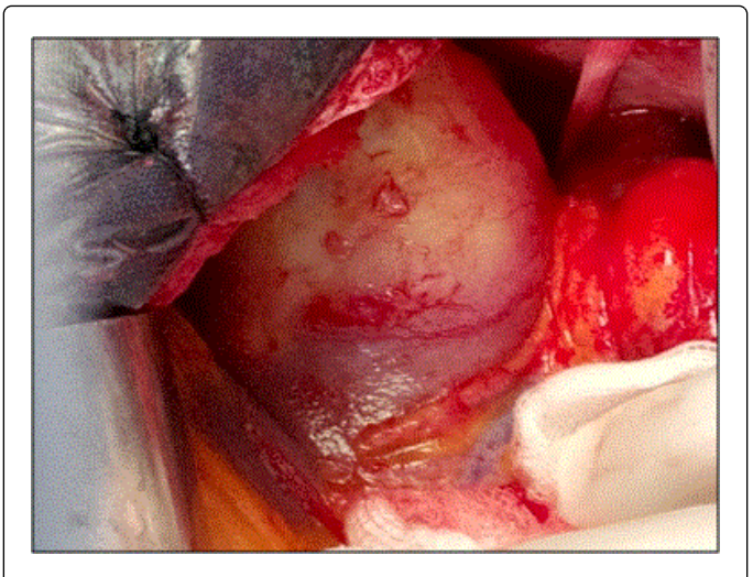
Figure 2: Operative view of the left ventricular cyst protruding into the pericardium (arrow).

The patient underwent a surgery via a sternotomy, and under cardiopulmonary bypass between the ascending aorta and the two vena cava. Intraoperative examination revealed that this cyst was originating from the inferior wall of the left ventricle (Figure 2).