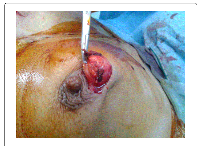
Figure 4: Intraoperative view of removal of hydatid cyst from the breast.

The liver and lungs are the most affected organs. Cardiac location is rare. The mostly affected sites of the heart are the ventricles, and the interventricular septum; whereas the pericardium and the atria are the least affected [4].