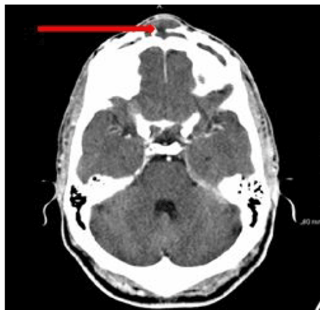
Figure 3: CT scan section showing the sub-periosteal abscess underlying the skin of the forehead.